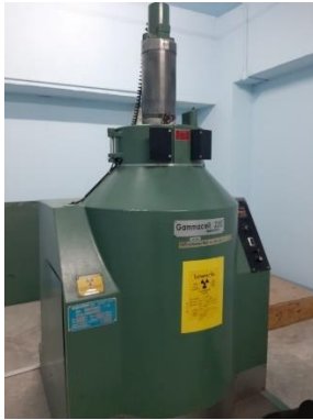
Figure 1. Cobalt-60 Gammacells-220 irradiator.