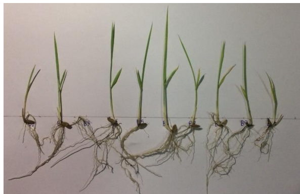
Figure 3. Root and shoot length of Jaw Haw Cultivars after 14 days of planting.

The shoot and root length are generally used to determining the effects of various physical and chemical mutagens. Maximum root length (3.47 cm) was observed in control treatment followed by treated seed of 60 Gy and 40 Gy (2.76 cm and 2.74 cm) and it was lowest (2.49 cm) in the treated seed of 20 Gy (figure 3). The maximum reduction in root and shoot length occurred with increasing radiation doses. A similar result was reported by Talebi and Talebi [12] in rice.