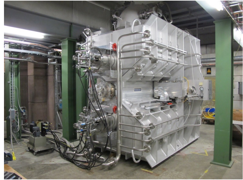
Figure 2: new 50MHz cavity