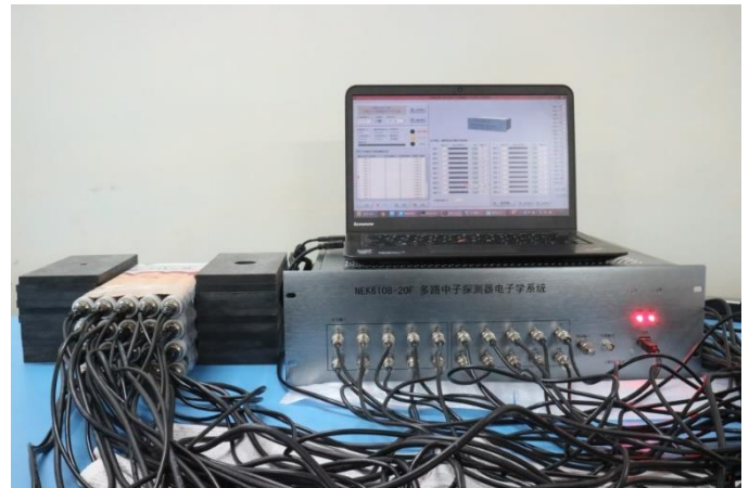
Fig. 1. Photo of the readout system which has 20 neutron detectors (crystal ST-401 and PMT), the electronics system and the software.

the design of modular power supplies, high precision DACs and the high voltage feedback circuit, and has the features of security and stability, high integration, etc.