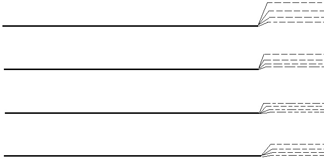
Figure 2.3: Comparison between L_0 (solid lines) and L (dotted lines)

certainty Principle is restricted to position-momentum commutation and time-energy uncertainty principle has been merely thought of a statistical measure of variance, a more generalized idea of GUP corrected commutation relation involving 4-momentum might give rise to discontinuity of time. This is beyond the scope of our work, but we hope to shed light on this topic in the future.