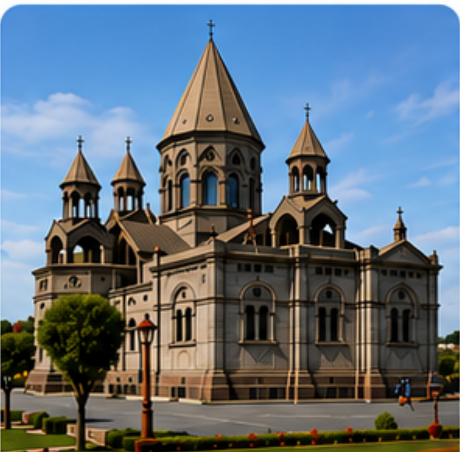
Mother See of Holy Etchmiadzin Spiritual center of the Armenian Apostolic Church

We are planning to organize a half-day excursion after the sessions on Wednesday to visit the Mother See of Holy Etchmiadzin , the spiritual center of the Armenian Apostolic Church and one of the oldest Christian cathedrals in the world, as well as Khor Virap Monastery , renowned for its historical significance and spectacular views of Mount Ararat . The excursion will conclude with a visit to Tushpa Wine Cellar for wine tasting and the conference dinner.