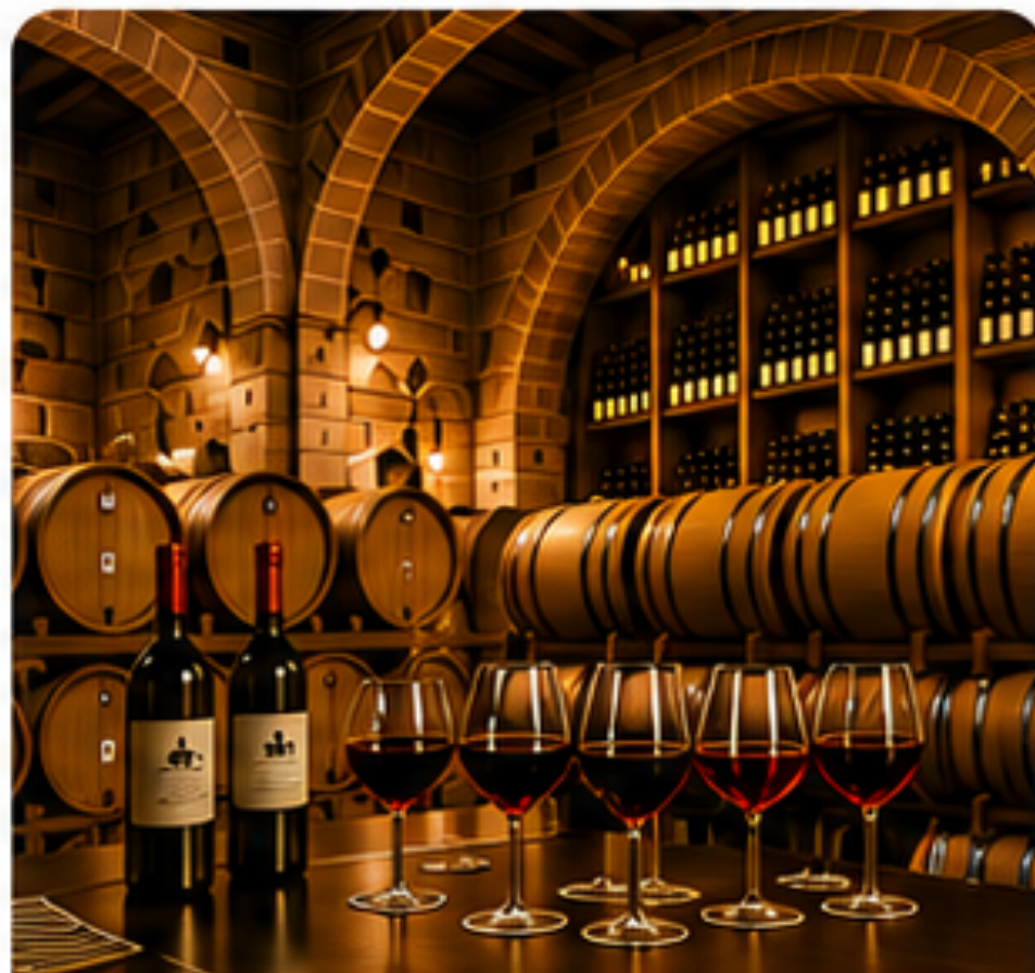
Tushpa Wine Cellar Wine tasting and conference dinner