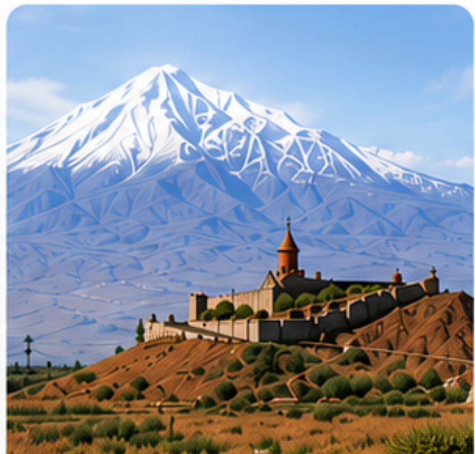
Khor Virap Monastery Historical site with stunning views of Mount Ararat